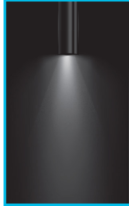
L33 - 3HX3V