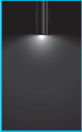
L67 - 6HX7V