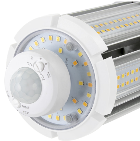
36W, 46W, 55W, 80W, 120W