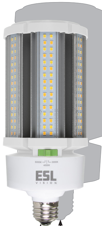
Ours — The Competition

Averaging a 23% lower cost and 7% smaller form factor than the nearest competitor's equivalent, ESL Vision's Corn Light is the most versatile lamp for virtually any HID replacement.