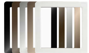
Field Installable Trim Rings Sold Separately: Black, Bronze, Nickel, Copper, and Field Paintable

Finishes: (ff)=(MW) Field Paintable, (BK) Black, (BN) Brushed Nickel, (BZ) Bronze, (CP) Copper