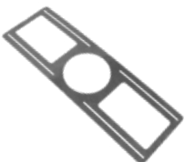
Down Light 4" Rough-In Plate